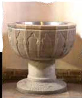
Font from 13th century