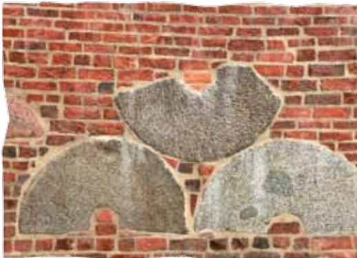
Millstones in medieval defence walls

a wooden palisade, surrounded by a moat and ponds. These fortifications survived till the year 1291.