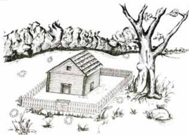
Pagan temple: reconstruction according to H. Janocha from the publication: "The Chełmska Mountain: the place of old cults and the Sanctuary of Our Lady", Koszalin 1991

on the site of the pagan temple. Originally, it fulfilled the function of a parish church for Koszalin and also a cem-