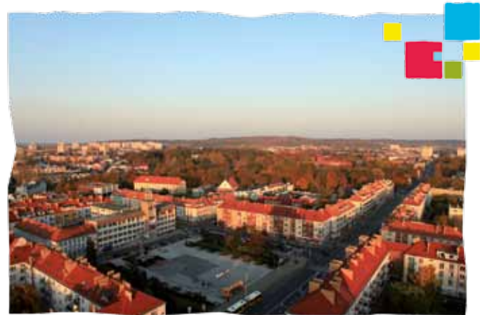
Koszalin: bird's eye view

Koszalin as a tourist destination is charming with its historical atmosphere and the fascinating present day. This is a town both with many monuments and numerous modern architectural solutions. Koszalin is also a place