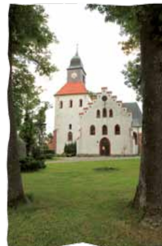
Church in Jamno

It is also worth to visit the Gothic church of Our Lady of the Rosary in Jamno. The present looks of this temple date back to the Baroque conversion in 1737; the church was rebuilt in this style in 1927 after a fire. The encircling walls, the block of the tower and corner buttresses were preserved from the Gothic period. The Baroque style is to be seen in the onion dome of the tower and 18th century interior furnishings: the main wooden altar with rich polychrome and with folk figures of two apostles: St. Peter and St. Paul, the pulpit (1750) and the baptismal font (1683).