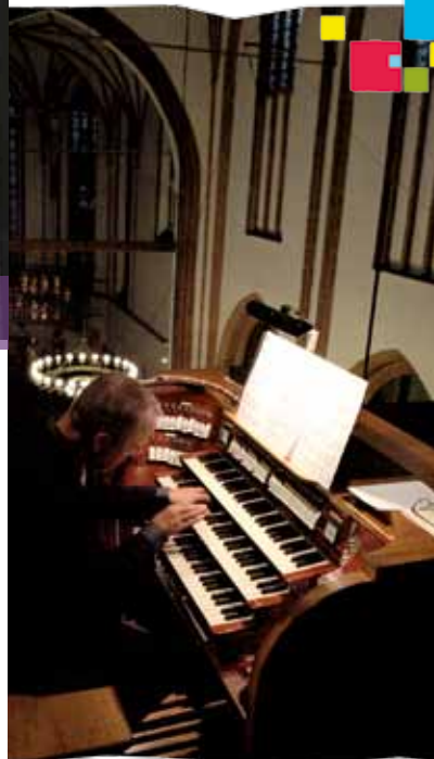
International Organ Festival

The most popular nationwide stand-up comedy marathon is held in the local amphitheatre on the last Saturday of July. Top comedians from all over Poland arrive on the invitation of the Koń Polski Cabaret. This is the motto of the Festival: "One minute of laughter makes your live one day longer", and the point is the final satiric song, one which is always very timely. The