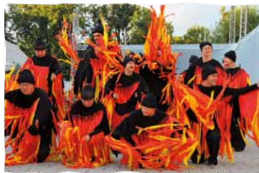
"Integration You and Me" European Film Festival

No Barriers discussions constitute an important element of this event, when