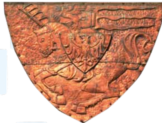
Koszalin coat of arms placed on the town hall building

This tenement, which is located by the cathedral church, reminds of the Medieval nature of the housing in Koszalin. The preserved fragments of the front facade and the Gothic arch