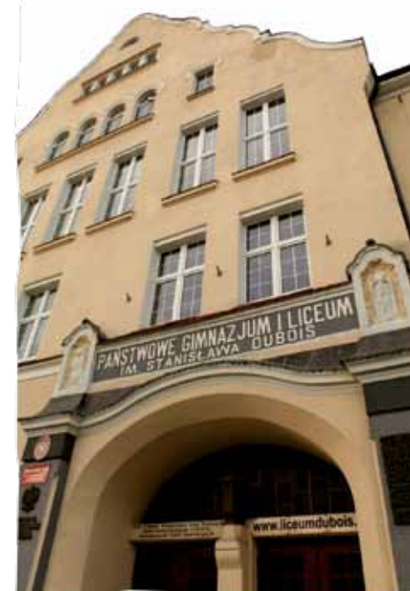
Building of 1st Grammar School

It was erected in the years 1910-1912 to House the Town's Female Grammar School of Bismarck Duchess. In 1944, a field hospital for German soldiers was functioning there, and starting