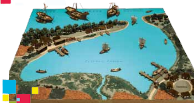
Model of the port of Koszalin 14th – 17th centuries: Museum in Koszalin

The heirless death of Prince Bogusław XIV, the last Grifit ruler, in the year 1637, caused the conditions of the hereditary treaty concluded with Brandenburg to be realized, as a result of which the Hohenzollerns became the sovereigns of West Pomerania. To their titles, they added: the "Prince (...) of Pomerania, Kashubians and Veneti". These decisions were recorded in the Westphalian treaty, which ended the thirty-year war that enfeebled Pomerania and Koszalin; yet, they were realized only in the year 1653 after the Swedish armies had retreated from Koszalin. After the year 1701, Koszalin was in the boundaries of the