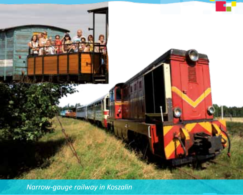
Narrow-gauge railway in Koszalin

the marina in Jamno. The boat shuttles on the route of Jamno – the Jamneński Canal – Unieście village. This flatboat, which was built in the river shipyard in the town of Płock, has a seating capacity of 67, and it can take bikes and wheelchairs. It takes as little as 20 minutes to cross the lake; this is the same as the time needed to reach this destination by car when there is little traffic.