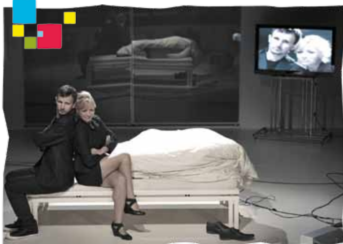
"Kartoteka" performance in the Baltic Drama Theatre.