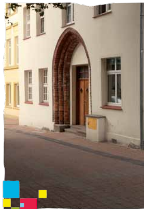
Tenement house from 14th century