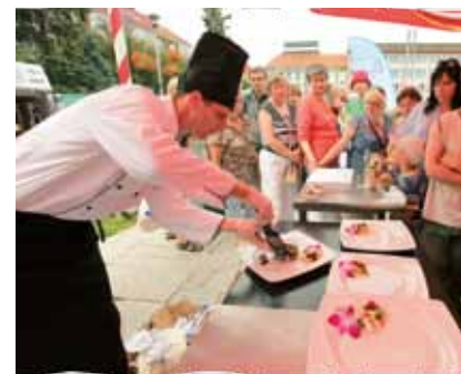
"Taste Street" Koszalin Culinary Festival

from other European countries. This outdoor event attracts numerous food lovers.