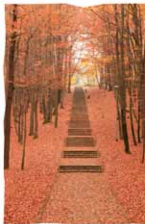
Way to the sanctuary