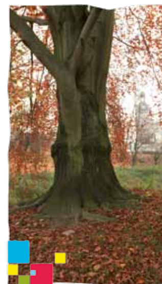
Copper beech: monument of nature in the Park of the Dukes of Pomerania

The "Bielica" reserve of the inanimate nature of soil type with the area of merely 1.3 ha is situated at the foot of the north slopes of the Chełmska Mountain directly by National Road no. 6. Typically developed humus on postglacial sandy seams overgrown with a fresh forest is the subject of protection. The faunistic bird reserve: "The Lubiатовskie Lake of Professor Wojciech Górski", administratively divided between Koszalin and Manowo Communes, takes up a considerably larger area: 370 ha. The panorama of this basin can be admired from a beauty spot on the route of tourist trails between the villages of Lubiатовo, Manowo and Wyszebórz. The newest estate in Koszalin: Jamno-Łabusz is situated within the boundaries of the "Koszaliński Seaside Strip" protected landscape with landscapes that are typical for coastal lowlands and inshore lakes. In the area of the