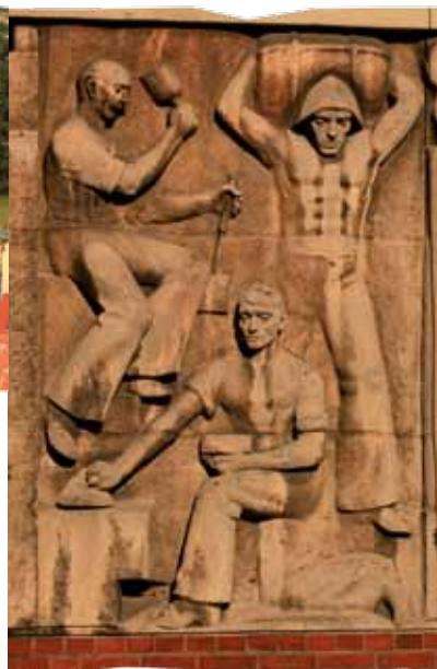
Low relief on the building of Bank Ochrony Środowiska

the so-called half-timbered wall. The location of the fire brigade building is where the great fire of the Town broke out in 1718, when most of the buildings were burnt down. At present, the building is continuing its original function.