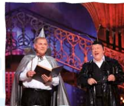
17th Summer Stand-Up Comedy Festival

This event is a perfect opportunity to present delicacies not only from Koszalin but also from the Polish cuisine and cuisines