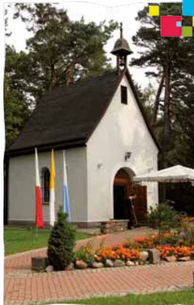
Sanctuary of the Covenant on the Chełmska Mountain