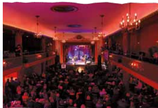
"Muza" Variété Theatre

Apart from a book collection that is made available in the traditional form, a sound library and a video library, this Library offers a reading room as well as a conference and cinema hall. The regional section is to be especially recommended to sightseers. There is a display case on composer Władysław Turowski, the author of The Song on Koszalin Land, and a display case that