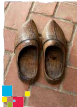
Wooden clogs from Jamno

a renovation and adaptation for exhibition purposes, the buildings have been the seat of the Museum in Koszalin since the year 1991 till this day.