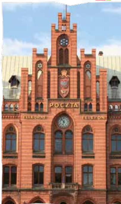
Main Post Office

It was erected in 1884 as the seat of the Management of the Post Office on the site of two buildings that