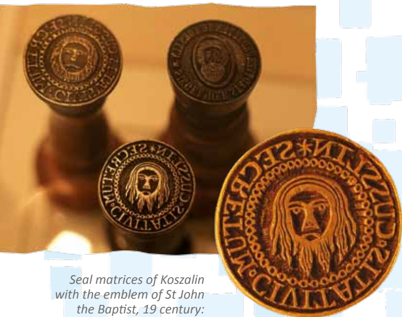
Seal matrices of Koszalin with the emblem of St John the Baptist, 19 century: Museum in Koszalin

Koszalin had 33.5 thousand of residents. In 19th century, Koszalin became famous for its factory of smoked salmon and goose breasts. Before the First World War, it boasted of the production of LVG, aircraft parts in a branch of the air plants in Hamburg. A modern paper factory, with one thousand of employees, was the largest plant before the Second World War. It was burnt down after Russians took away the machines in the year 1945.