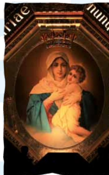
Image of the Thrice Extraordinary Mother of God

God: the Daughter of the Eternal Father, the Bride of the Holy Spirit and the Mother of God's Son, looks similar everywhere. In 2000, there was a coronation of the image with an amber crown. In 2011, on the initiative of Cardinal Stanisław Dziwisz, a relic: a drop of the blood of the blessed John Paul II, enclosed in the papal cross, was put in the altar of the chapel. Now, like in the past, crowds of pilgrims come to the sanctuary to attain the following graces through prayers: the grace of settling in, the grace of internal transformation and the grace of apostolic zeal, and also to thank for the graces they have already received. The two presidents of the Republic of Poland, who died in the catastrophe in Smoleńsk, have been the pilgrims to the sanctuary.