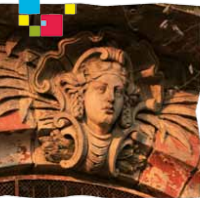
Low relief on the Regency Building

of the Post Office was the result of the communications development of the region. As early as in 1803, there was a horse post station, which functioned till the year 1911. The Telegraph Construction Office was also located in this building.