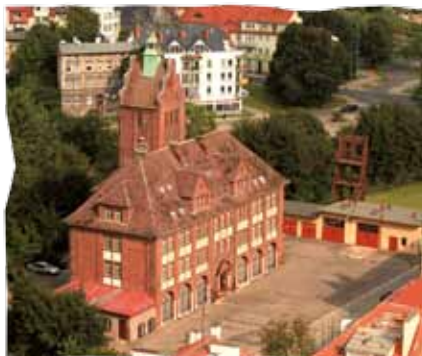
Fire Brigade Building

It was erected in the year 1928, with its characteristic high tower on the west side, which originally served as a wall for training exercises at heights. Formerly, the front facade and the training yard on the west side; after the Second World War, the main training yard was placed on