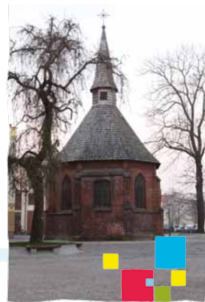
St. Gertrude's Chapel

Built in 1383 outside the Town's walls, it initially performed the function of a hospital chapel, and later a cemetery chapel. In 1735,