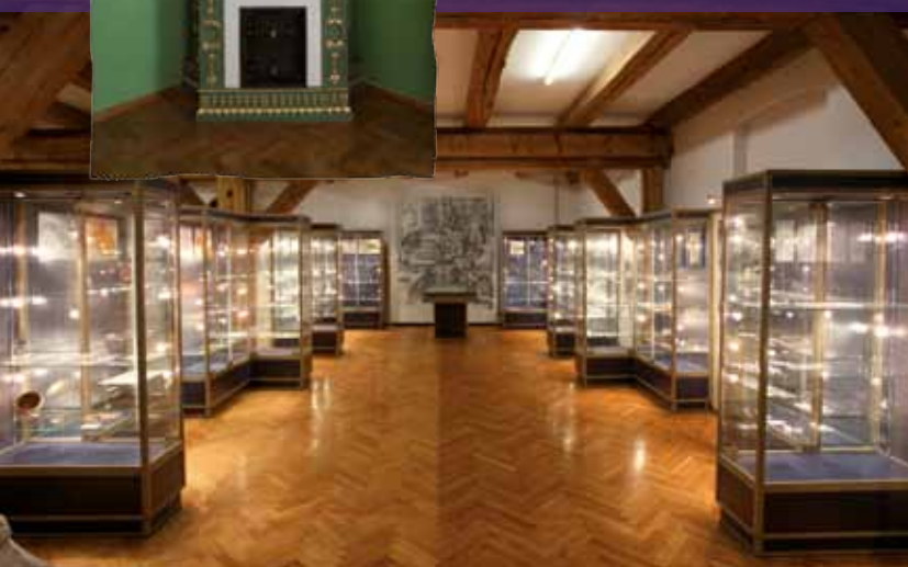
Museum in Koszalin

Here, you can see permanent exhibitions: “Koszalin from Middle Ages till the Present Day”, interior furnishings “Ancient arts and craft from Baroque to Secession”, a numismatic exhibition “Coins and medals” as well as a documentation of artistic plein-air workshops “Osieki 1963-1981”. A historic farmhouse from Dąbki village houses ethnographic exhibitions: “Culture Island. Jamno Village Near Koszalin” and “Shoemaker's Workshop”, and a barn that was brought from Paproty village houses the “Pomeranian Smithy” exhibition, which presents the blacksmith's workshop and products. In the year 2008, a half-timbered building was put to use to house an archaeological section. (ul. Młyńska 37-39) tel. 94 343 20 1 www.muzeum.koszalin.pl