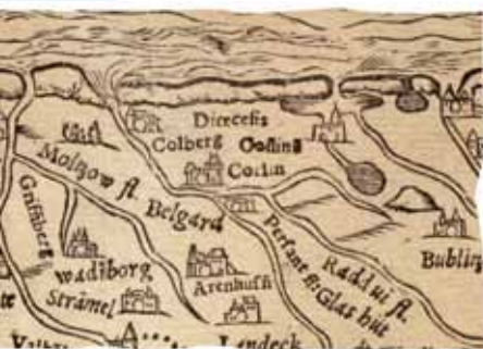
Fragment of the oldest map of the West Pomerania according to Artopeus from Koszalin from the year 1544: Museum in Koszalin

in 1816 turned out to be significant for the development of Koszalin. As a result of it, Regierungbezirk Köslin (the Koszalin Regency) was established in the borders which were similar to those of the Koszalińskie Province in the period of 1950-1977. At that time, there was a significant economic development. The population numbers, which exceeded 10 thousand in 1858, also increased; in the year 1939,