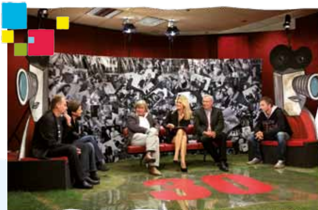
Koszalin Festival of Screen Debuts "The Young and Film"

medieval merchants, market stalls were installed at what is the present Dworcowa street. In the year 2004, the Ethnographic Department of the Museum in Koszalin took over the organization of this fair.