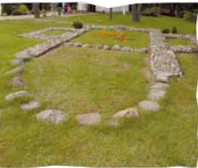
Foundations of the chapel from 13th century