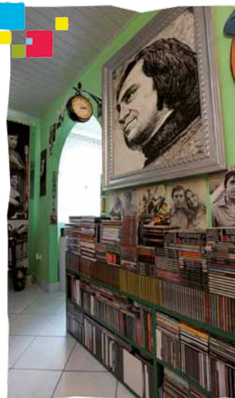
Włodzimierz Wysocki Museum

In summer, the Water Board organizes a cycle of cultural and promotional events with water as the central figure: “The Celebration of Water”. The Museum is situated in the building of the former filtering plant. The exposition is made available upon request by the local Water Board. You can see an exhibition of historic documents and installations that were once used to provide the Town with water; the oldest exhibit is from 18th century. Other facilities can be visited during ecological and educational classes (Zwirowa street). tel. 94 342 66 70 www.mwik.koszalin.pl