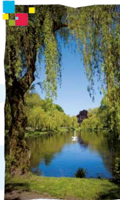
Park of the Dukes of Pomerania.

The oldest part of the park, the so-called Old Promenade, was created in 1817 at the foot of the defence walls. The work connected with marking out of the paths, construction of the fountain, alteration of the pond and regulation of the river continued until the year 1838. In the year 1933-1934, the pond was renovated and an island for swans