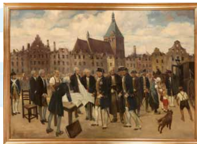
Koszalin after the great fire in 1718 Oil picture from 19th century: Museum in Koszalin

The emblem of Koszalin presents a blue shield with