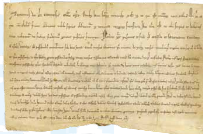
Foundation charter of Koszalin dated 23 May 1266: collections of the National Archive in Greifswald