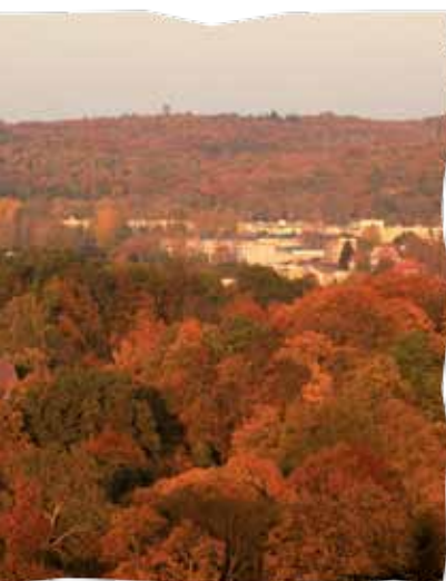
Park of the Dukes of Pomerania

and tourists. The beauty of the park is emphasized by 124 species and varieties of trees and bushes including as many as 16 of those which have been recognized as the monuments of nature, and also by the Dzierżęcinka River being framed with paths and a pond with the Island of Swans. The Dendrology Park with an area of 8.5 ha is the largest object in the Town. It stretches along the Dzierżęcinka River to the north of the town centre; the Park by the Amphitheatre and the Tadeusz Kościuszko Park almost equal it. Several monuments of nature can be admired here. The Park of Władysław Turowski