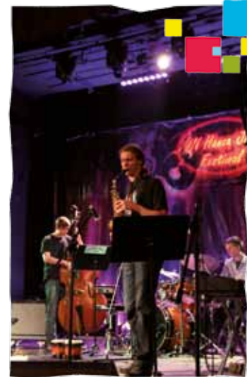
Hanza Jazz Festival

The name of this event serves to emphasize the membership of Koszalin in the Middle Ages in an association of seaport towns. This October festival is above all addressed to young musicians and jazz fans from all over Poland. It does not merely include concerts but also music workshops hosted by jazz celebrities such as Krystyna Prońko, Jan Ptaszyn Wróblewski or Adam Wendt.