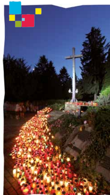
Memorial to the Martyrdom of the Polish Nation