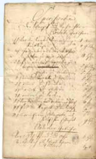
Hangman's list of charges

was built. The most interesting specimens in the park include the following: an over three hundred year old maple sycamore (the so-called Witches' Tree), magnolia acuminata (the only one tree of this kind in the Town), Amur cork-tree, baldcypress and maidenhair tree. It is also worth to take a stroll along an avenue of London plan-trees.