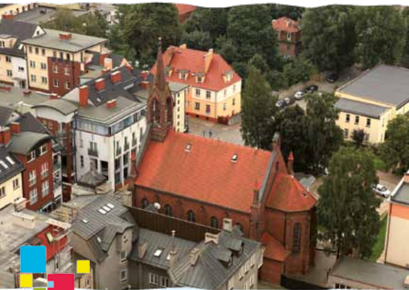
St. Joseph's Church