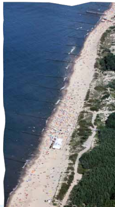
Beach in Mielno

This is the name of an international bike trail which, also via ferry