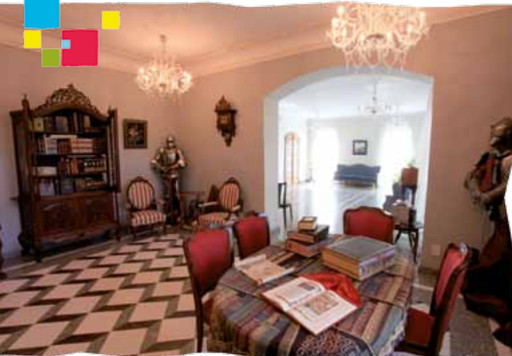
Museum of Book Arts